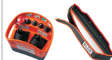
TRASMITTENTE CINGHIA MARSUPIO